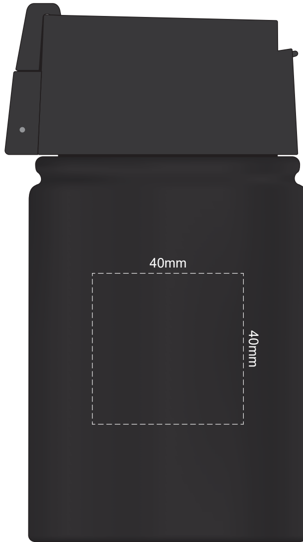
100% of Actual Size Pad Print SIDE