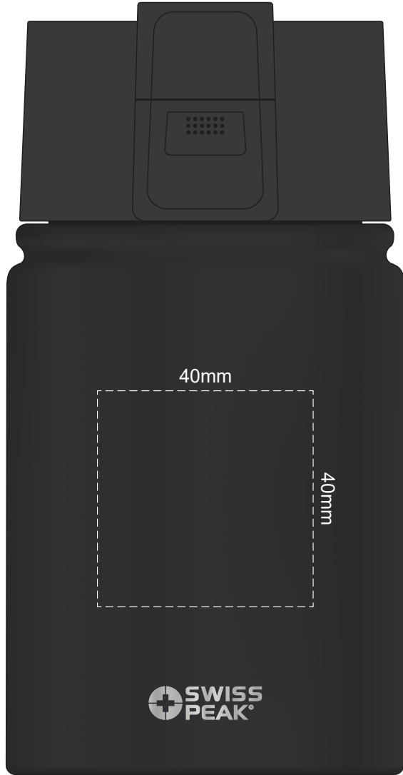
100% of Actual Size Pad Print FRONT